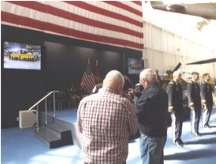
Graduation– Photos, Mum Beach

I had a brick barbeque grill outside and a couple of shade