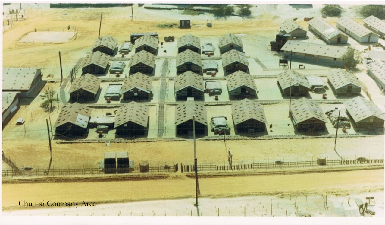
Chu Lai Company Area

2014 Reunion in Savannah, GA– Oct 8-11th